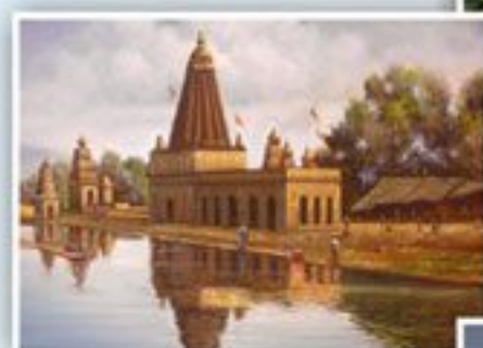
◆ Ganpati Mandir, Wai.