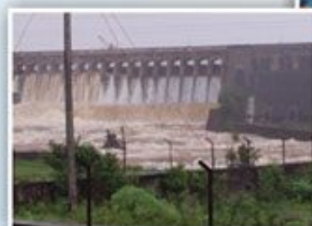
◆ Bhatghar Dam, Bhor