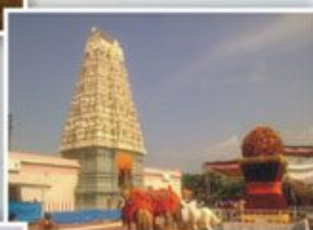
Balaji Mandir ◆